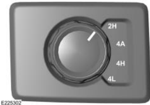
Figure 2 - Example of MSS with 4A selection

4. Does the vehicle have a MSS that includes a 4-wheel auto (4A) option? (Figure 2)