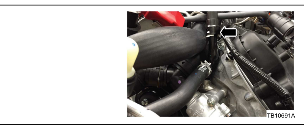
Figure 1 - Article 16-0019