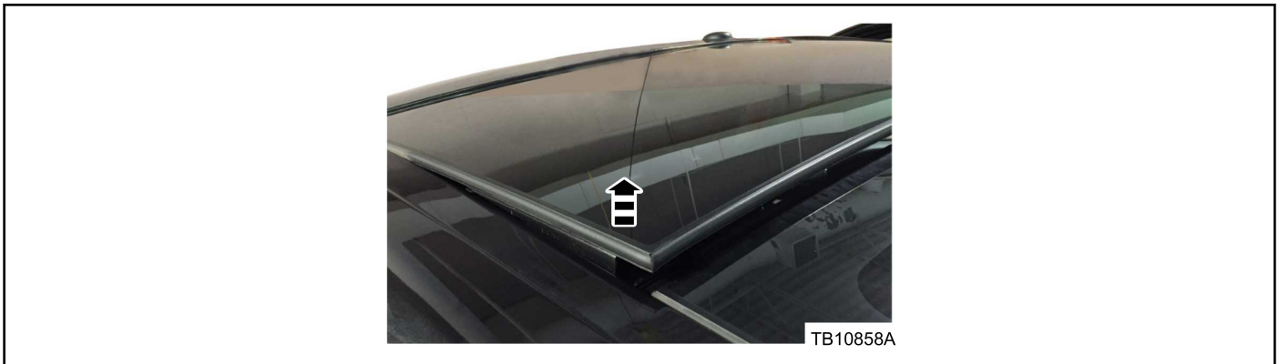
Figure 1 - Article 16-0020