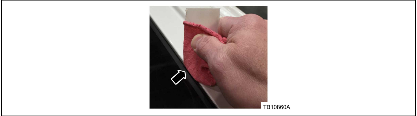
Figure 3 - Article 16-0020