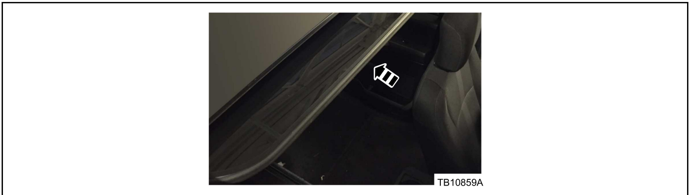
Figure 2 - Article 16-0020