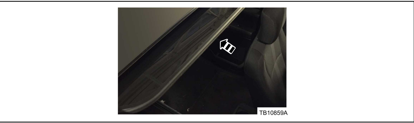
Figure 2 - Article 16-0020