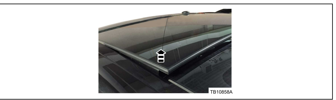
Figure 1 - Article 16-0020

1. Position the glass panel to the vent position. (Figure 1)