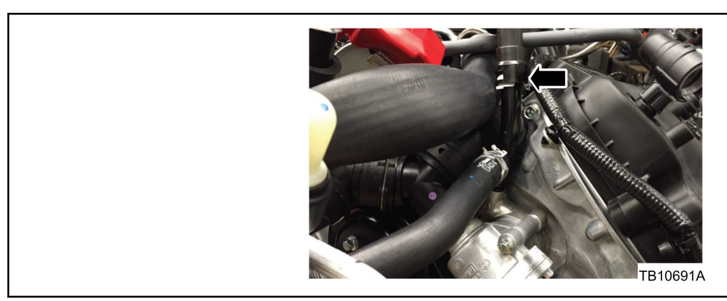
Figure 1 - Article 15-0073