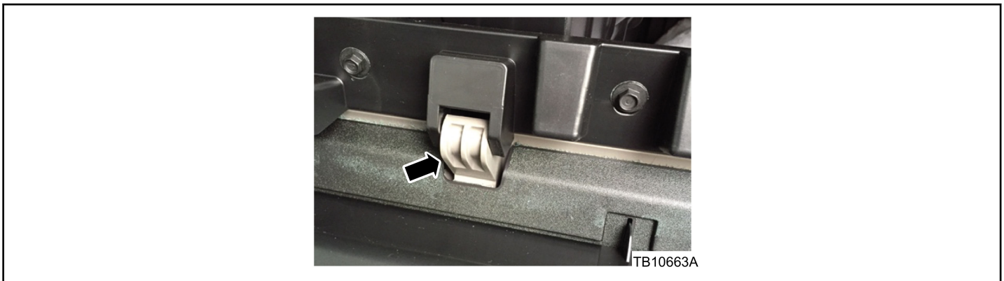
Figure 4 - Article 15-0045