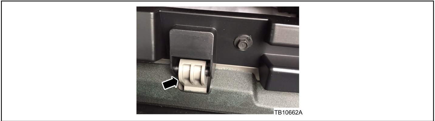
Figure 3 - Article 15-0045