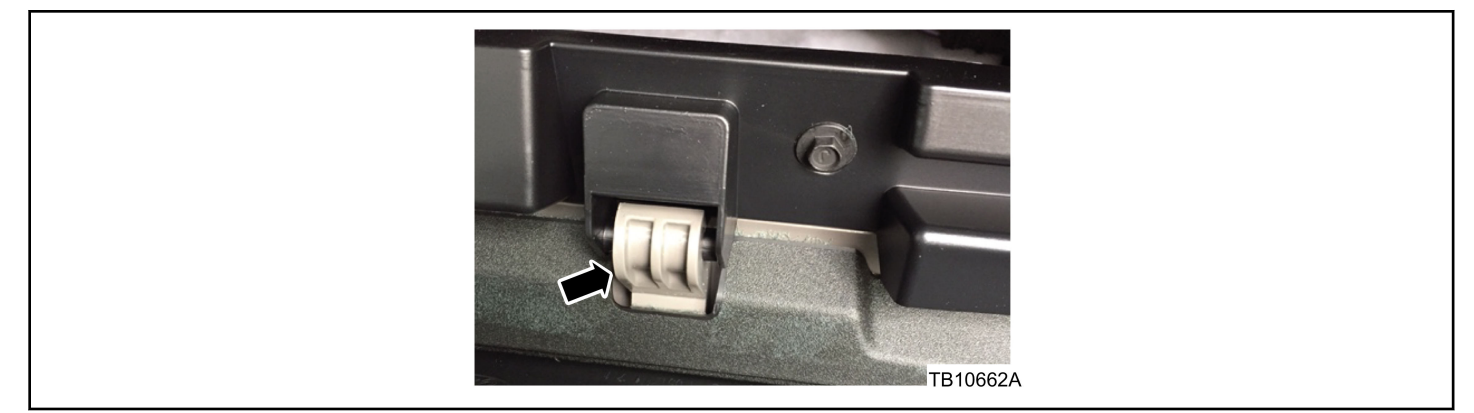
Figure 3 - Article 15-0045