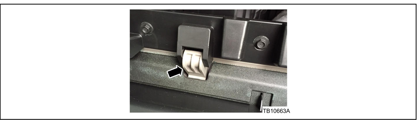
Figure 4 - Article 15-0045