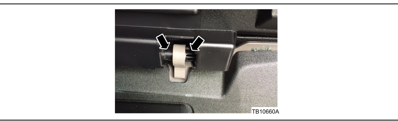
Figure 1 - Article 15-0045